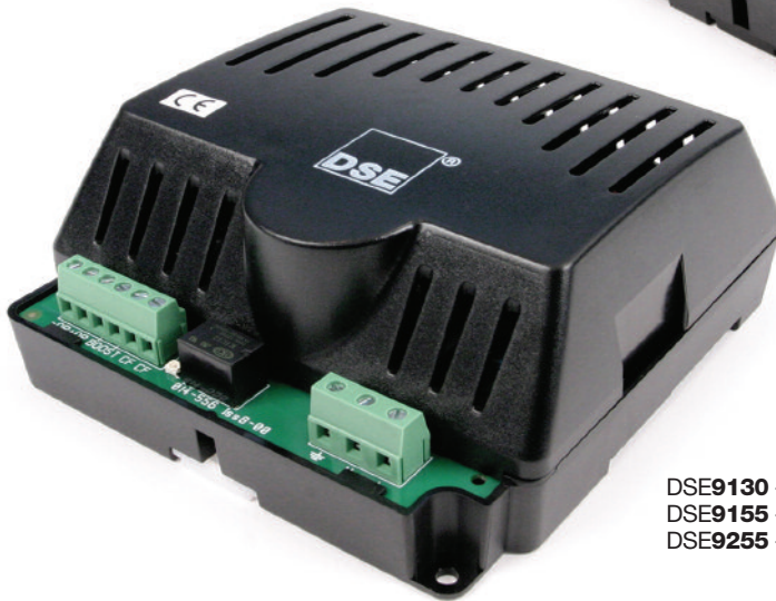
DSE9130 - 5 A 12 V DSE9155 - 2 A 30 V DSE9255 - 5 A 24 V