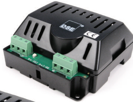
DSE9150 - 2 A 12 V